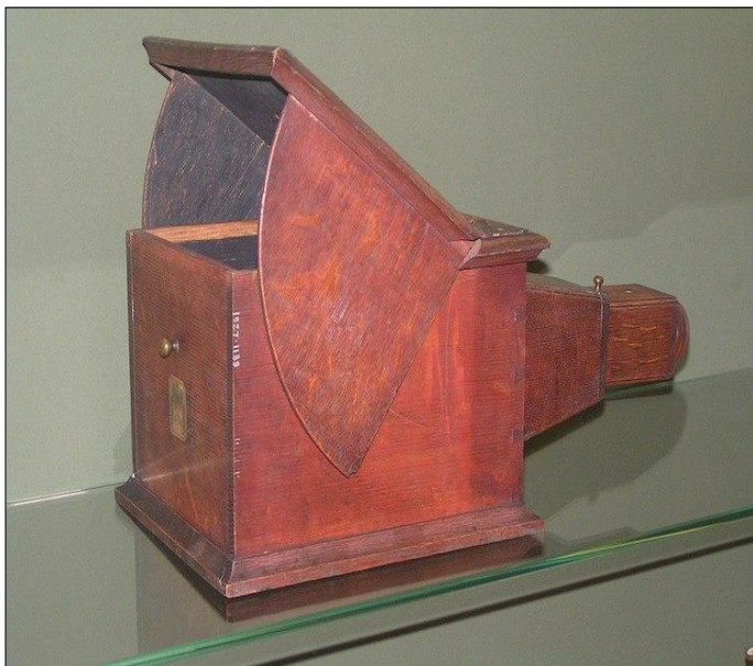
My Modern Met, "A camera obscura device." Photograph. https://mymodernmet.com/camera-obscura/

30 Phyllis R. Parker. "The Nanjing Massacre: A Japanese Journalist Confronts Japan's National Shame." Education About Asia: Association for Asian Studies . Volume 11:2 (Fall 2006): Rethinking Our Notions of Asia. " https://www.asianstudies.org/publications/ea/archives/the-nanjing-massacre-a-japanese-journalist-confronts-japans-national-shame/